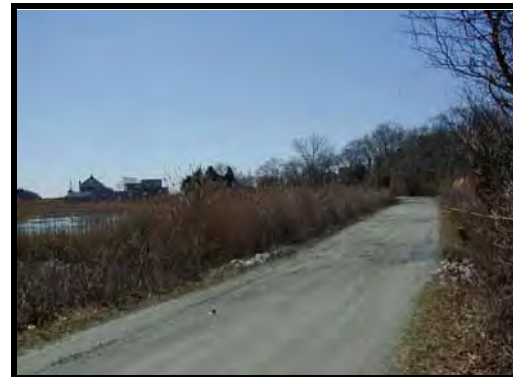
Gravel road passing over restriction DA06