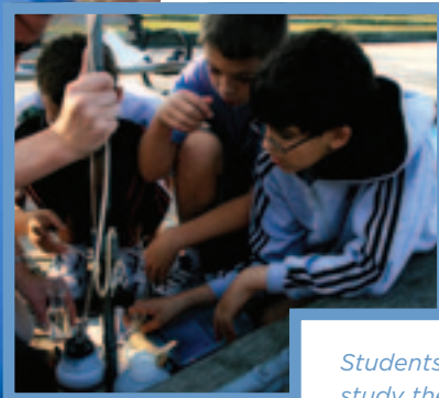
Students from Nativity Prep in New Bedford study the water quality of the harbor during an afterschool program.

In addition to our long-term investment in Bay stewardship among youth and the public at large, we also focused on engaging today's decision makers in government and business whose work impacts the health of Buzzards Bay. The 2011 decision-maker workshop series focused on reducing nitrogen pollution from wastewater in both large scale municipal wastewater treatment facilities and in on-site treatment systems like septic systems. The two workshops in March featured presentations by experts from around the northeast on existing and innovative technologies for reducing nitrogen pollution and field visits to see the technologies in action. The audience of 50 included municipal officials, wastewater engineers, and conservation professionals from across the watershed and many commented that these were among the most helpful trainings they had attended.