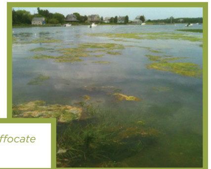
Excessive algae blooms from nitrogen pollution suffocate West Falmouth Harbor for much of the summer.