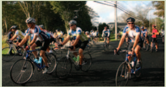
Cyclists hit the road at the start of the 5th Annual Watershed Ride in Westport.

Gray skies gave way to sunshine as 116 riders began the Buzzards Bay Coalition's 5th Annual Watershed Ride on Sunday, October 2nd, 2011. Pedaling through the bucolic back roads of Westport and Dartmouth, the beaches and working waterfront of New Bedford, the bike paths of Fairhaven and Mattapoisett, the farmland and bogs of Rochester and Wareham, and the coastal roads of Bourne and Falmouth, cyclists and volunteers were on the road to support and celebrate the Buzzards Bay watershed.