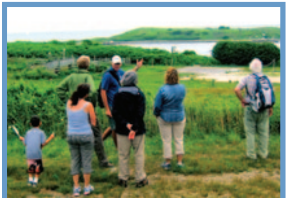
Learners of all ages take part in a Bay Adventure to Penikese Island.