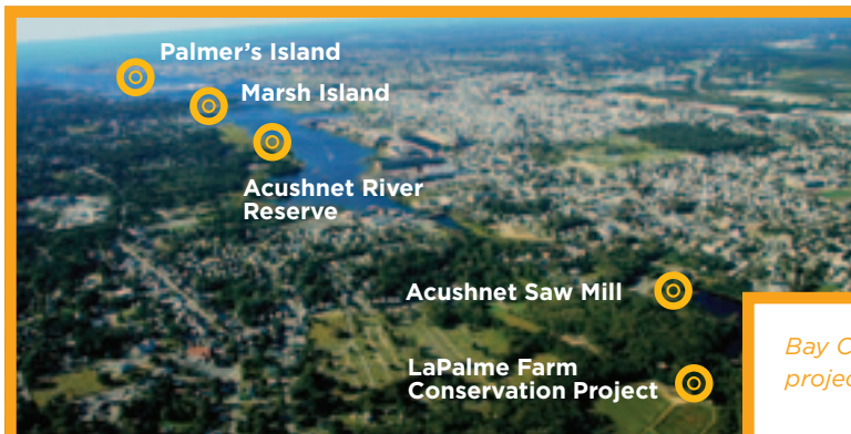
Bay Coalition-led restoration and conservation projects stretch the length of New Bedford Harbor.

to improvements in fish passage with the construction of a new fish ladder to pass Hathaway Pond Dam. It also lays out a clear path for finding a sustainable water source for Beaton's Inc's cranberry bogs and completing the full restoration of the Sippican River.