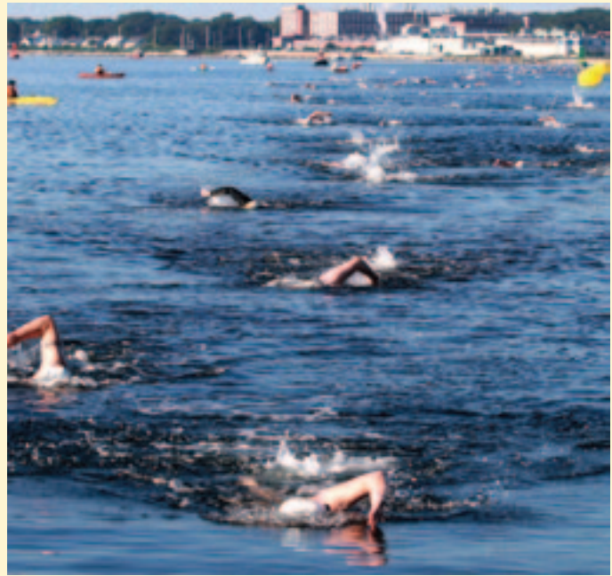
A record 216 swimmers raced across the Bay in the 18th Annual Buzzards Bay Swim.

On a crystal clear July morning, 216 swimmers dove into Buzzards Bay to demonstrate their support and appreciation for a healthy Bay. They came in droves to kick off the July 4th weekend by taking part in the 18th Annual Buzzards Bay Swim and raising over $113,000 for the Bay Coalition.