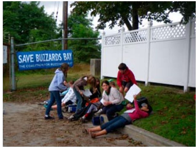
Volunteers from the 6th grade at Dartmouth's Friend's Academy take a break from a day cleaning up the shoreline at the Coalition's Marsh Island property in New Bedford Harbor.

As the Coalition continues to protect important lands of the Bay's Watershed, we take on increasing responsibility for the stewardship of these preserved areas . This year our staff and representatives from our partner land trusts visited