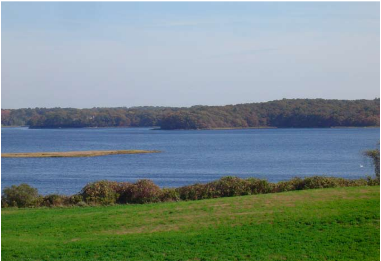
The Slocum River's scenic beauty is preserved by the Koch Conservation Restriction

all 14 properties upon which we hold conservation restrictions. Annual monitoring compares the existing conditions observed to those recorded at the time the CR was acquired to assure that conservation values are being upheld. This year the Coalition's Board of Directors adopted official procedures for monitoring of conservation restrictions to guide our stewardship into the future.