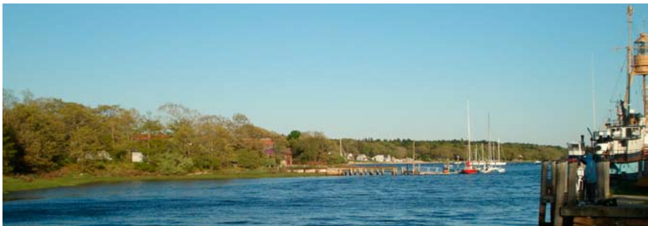
Wareham residents are coming together to develop concrete steps the town can take in 2010 to reduce nitrogen pollution.

■ The Coalition has launched a consensus-building process aimed at building support for measures to clean-up the serious nitrogen pollution degrading Wareham's coastal waters. Various groups in the town have proposed nitrogen-reducing bylaws at town meeting but none have succeeded. With the help of facilitator David Straus, the Wareham Nitrogen Consensus is bringing together more than 50 town residents to craft and build support for concrete measures to reduce nitrogen pollution from both residential septic systems and cranberry bogs . We hope that the collaborative process being developed will not only move Wareham toward healthier waters, but also inspire other communities to take similar action.