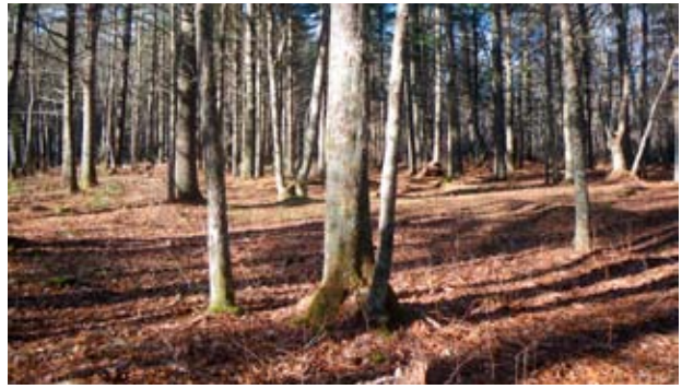
Where our drinking water starts its journey to our taps.

Over the past decade, the Coalition has been instrumental in the protection of 710 acres of land along the coastline and within the watershed to one of the region's most sensitive and naturally-diverse waterways: Nasketucket Bay in Fairhaven and Mattapoissett. Moving inland to protect the forests and wetlands that straddle the Nasketucket River, the bay's primary freshwater stream, the Coalition partnered with the Town of Fairhaven to continue this work by purchasing the 44-acre Nasketucket