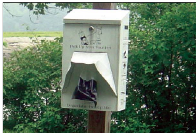
Figure 104. Dog waste bag dispenser in Bourne.

For public health officials, the biggest obstacle in utilizing water quality testing data is that it takes 24 hours to receive the results because of incubation times needed for bacterial growth in media. This delay increases exposure of bathers to unsafe bacterial levels, and also contributes unnecessarily long closures if an ephemeral event contributed to the closure. The testing results delay also makes it very difficult for investigators to track the origins of contamination because sources may dissipate before a field investigation be-