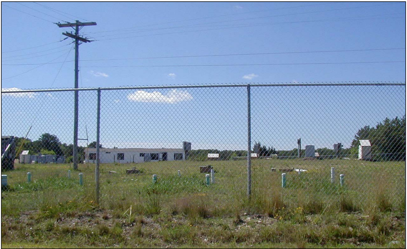
Figure 60. Photo of the Massachusetts Alternative Septic System Test Center.

The construction of the Massachusetts Alternative Septic System Test Center at the Massachusetts Military Reservation by the Buzzards Bay National Estuary Program in partnership with Barnstable County Department of Health and the Environment and Massachusetts Department of Environmental Protection was an important achievement toward implementing key goals and objectives contained in the 1991 Buzzards Bay CCMP onsite wastewater management action plan, including "to promote innovative technology that will reduce nitrogen."