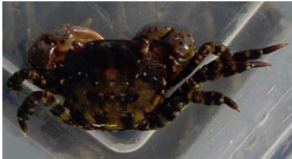
Salem Sound Coastwatch