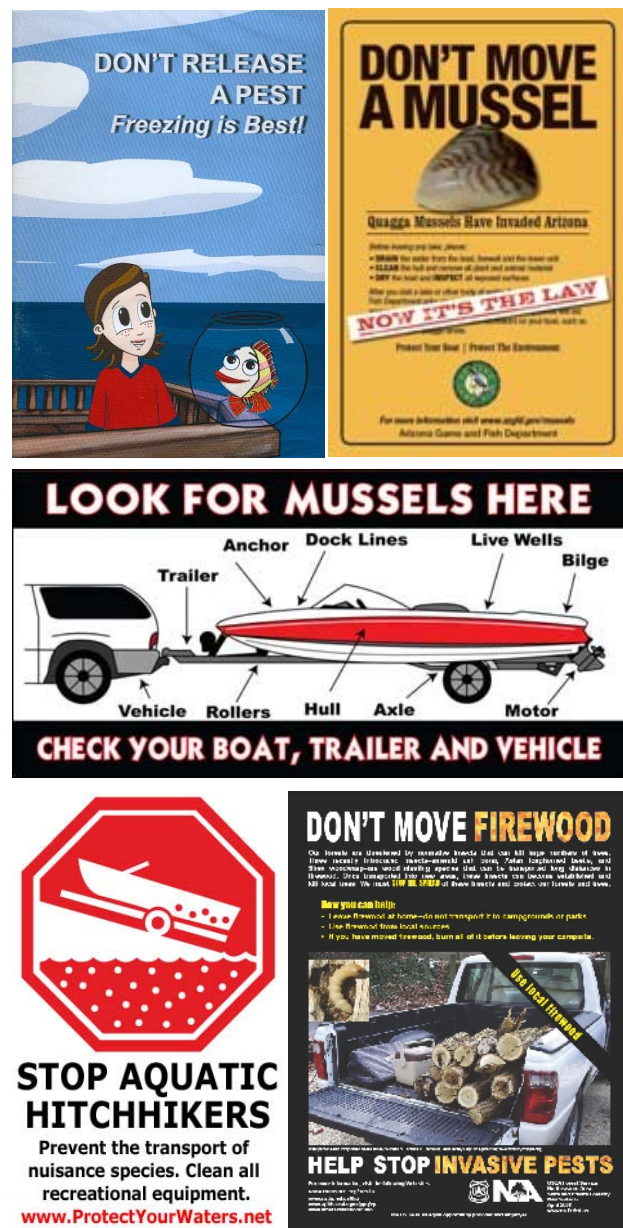
Figure 83. Various public education graphics and signs relating to introducing exotic species.

Besides outreach and education, regulation and enforcement will be the principal mechanism to prevent, control, or minimize future introductions. This will require improved enforcement of existing regulations, and adoption of more effective new state and federal rules. For example, in 2010, the US EPA promulgated new