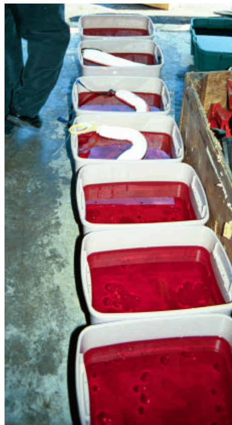
Socks being placed in bins.

To evaluate hydrocarbon uptake capacity, one and a half quarts of hydrocarbons composed of 3 cups of engine oil (10W30) and