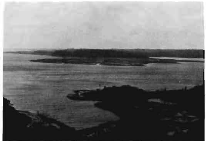
Slocums River Estuary, Dartmouth - Southern Buzzards Bay

Project Description: The Lloyd Center will provide support and coordination for the Citizens Advisory Committee activities including regular meetings, public programs and special workshops and gatherings related to Project objectives and outcome. A bi-monthly Newsletter and an Annual Report will be prepared by the Center, and will be distributed throughout the Buzzards Bay area. A series of public workshops and presentations will be made around the Bay to provide information and to encourage local involvement.