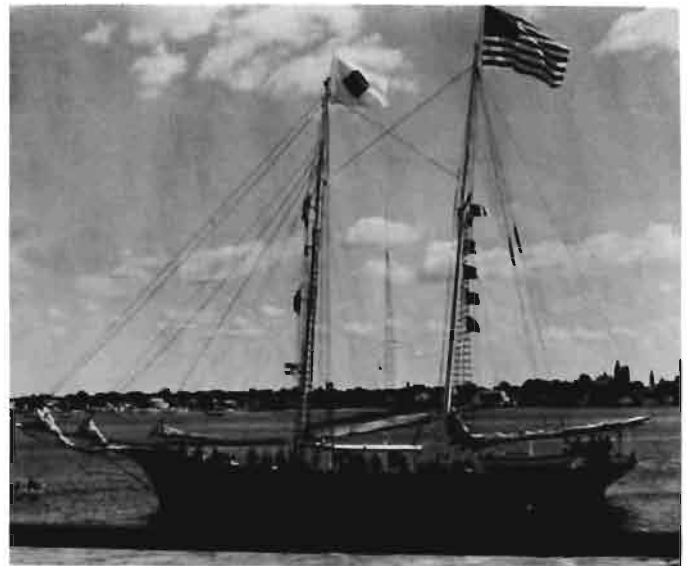
Tabor Academy's Tabor Boy