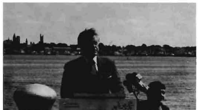
Senator Edward Kennedy